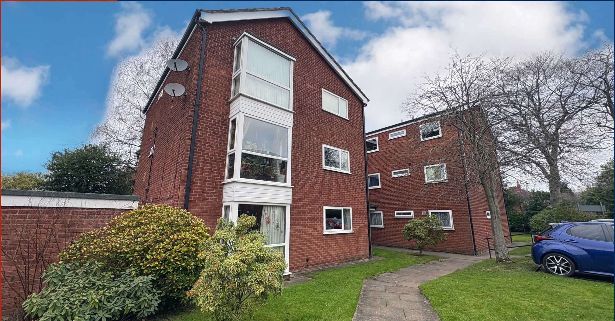
St. Annes Court Northenden Road, Sale, M33 3HB